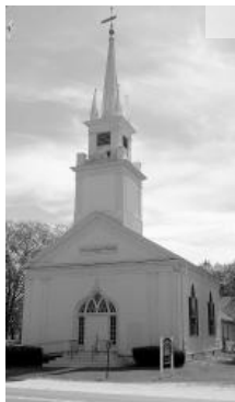
ELIJAH KELLOGG CHURCH

HARPSWELL — The Elijah Kellogg Church is embarking on a three-year $400,000 capital campaign to raise funds to preserve its historic church on Route 123 in Harpswell Center.