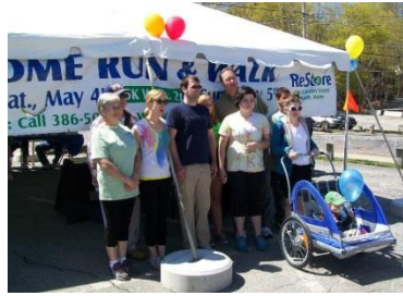
Team Elijah Kellogg!