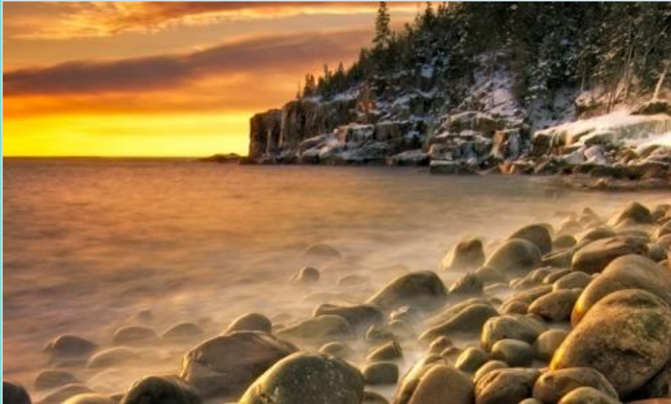
THE BEAUTY OF A COASTAL WINTER