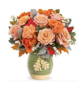
The flowers today are from the Hurst family in loving memory of Robin Hurst.